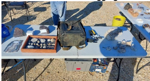
Lots of door prizes donated by club members for those who came to hunt Summerville Agate.