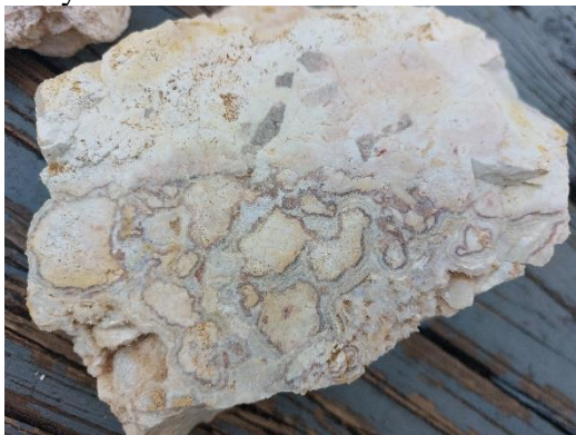
A picture-perfect specimen of Summerville Agate.

Although Jay had 70+ people not counting our club to sign up, the cold temperatures kept the number down to 42 including our club members. Looks like they are dressed for the weather.