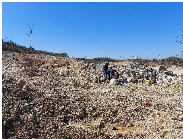
Piles and piles of stuff to go through and just a hop, skip and a jump from the parking lot.