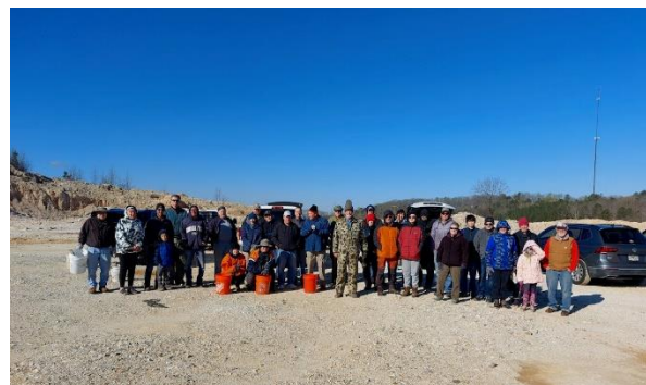
All the attendees ready to dig!