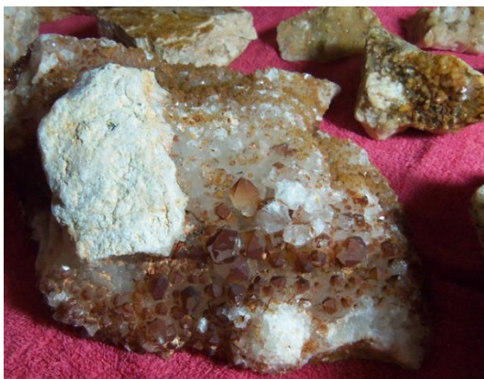
Quartz cluster with iron stain.