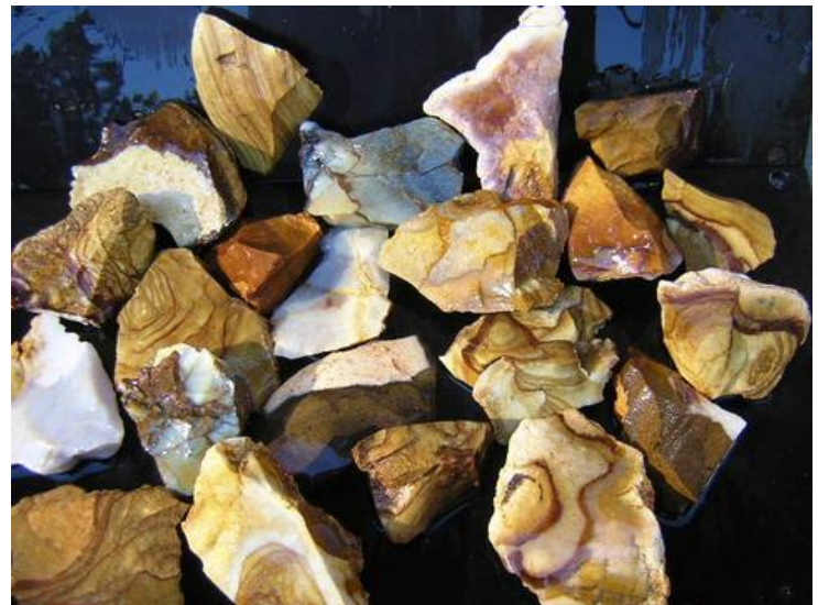
Georgia Queen Picture Jasper