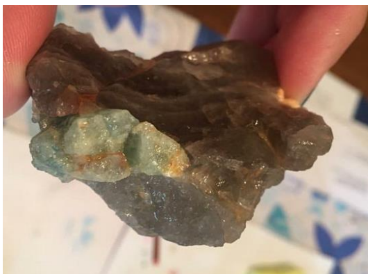
Aquamarine in smoky quartz matrix, found July 2017.