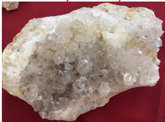
Quartz cluster, approx. 8" across, found Sept. 2017

TRIP: This is a very popular site that has had the spoil heaps turned over regularly this fall. In our travels around the country we've run into people from all over who love coming here. Recently people have been finding aquamarine in smoky quartz matrix. We often don't know what we've found until we get it home and clean it up!