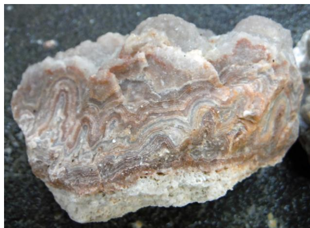
Banded lace chert/agate