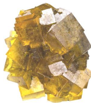
Saxony, Germany Mineral Specimen

world.” It is transparent to translucent. Fluorite has a white streak and a vitreous luster. The specific gravity can vary from 3.175 to 3.56 if rare earth elements are present. It is a defining mineral on the Mohs scale at 4. It is a globally occurring mineral with significant deposits in over 9,000 areas. Fluorite is a fluorescent mineral under UV light. Fluorite also exhibits the property of thermoluminescence or giving off light when heated.