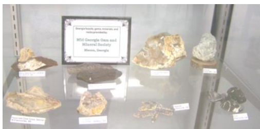
Shelf with Club Information and two other shelves with specimens.