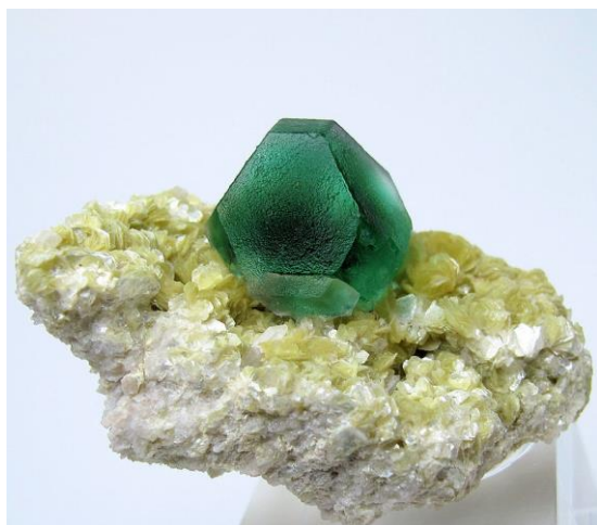
Deep green isolated fluorite crystal on a mica matrix. Erongo Mountain, Namibia

Fluorite is a halide mineral. It crystallizes in an isometric cubic habit. It is colorless unless impurities are present. Due to contamination with so many different impurities, Fluorite has been dubbed “the most colorful mineral in the