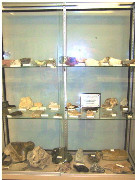
Full cabinet with specimens from Georgia.